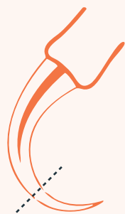
Typical Cut Line for Grooming

With the bird gently restrained, swab the toenail with alcohol to ensure the area is disinfected. Use a sanitized pair of nail clippers to clip the bird's toenail just enough to nick the vein (approximately 2/3 of the distance from the root of the nail) and produce a drop of blood.